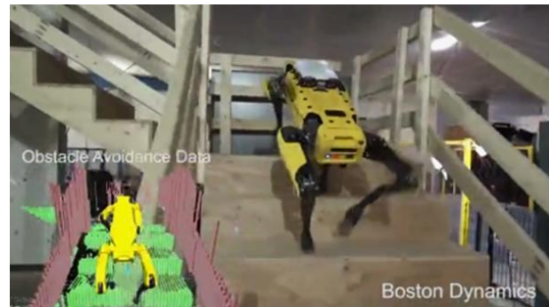
Figure 3: Boston Dynamics robot climbing stairs, while avoiding obstacles: Source: Dailymail, 2018

human rescuers with enhanced speed, agility, maneuverability, load carrying capacity, resistance to fire, laser and infra-red based visual. Examples of such robots have been developed by the company Boston Dynamics (Boston Dynamics, n.d.; Dailymail, 2018) which can perform such tasks and have been well demonstrated in indoor and outdoor spaces (Figure3) .