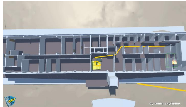
Figure 1: 3D simulation of dynamic wayfinding in case of fire on a staircase, UNSW, Sydney

storage points, etc. is required in multi-floor large buildings in addition to the floor connecting stairs, inside and outside connecting corridors or lobbies. This locational information in traditional 2D mode is less effective compared to 3D spatial information for understanding the indoor structural formation and navigating optimally (Gangraker et al., 2015). Figure 1 illustrates an imaginary use of 3D indoor information in an emergency situation.